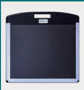
DETECTOR PROTECTOR, 14x17, 17x17