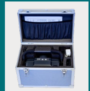
RUGGED TRANSPORT CASE