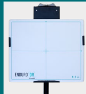
PORTABLE DETECTOR STAND