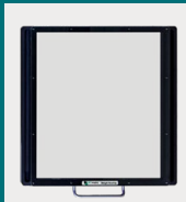
DETECTOR WEIGHT BEARING COVER, 14x17, 17x17